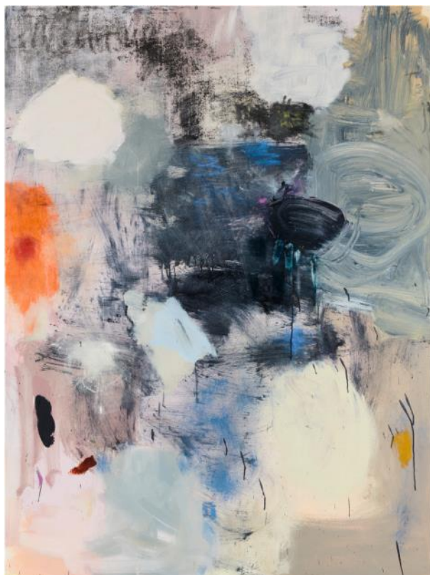
Megan Rooney, Origin City , 2019, Kunsthalle Düsseldorf, courtesy the artist and DREI, Köln, Foto © Achim Kukulies, Düsseldorf