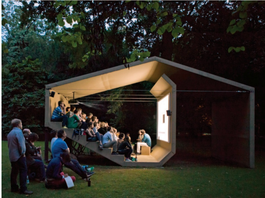
Cinema Pavilion